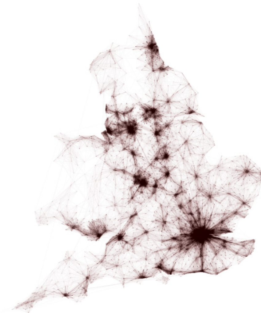
FIGURE 1 Travel to work patterns across all modes

As housing and planning authorities, district councils understand and know these local economic areas intrinsically. For instance, they develop strategic housing market assessments to understand housing and economic trends, while connecting with every business as billing and licencing authorities. Devolution and the local recovery effort must put districts at the centre of delivery, focusing on growing our markets of the future while celebrating the wider ceremonial county, without getting held back it's out of date administrative boundary.